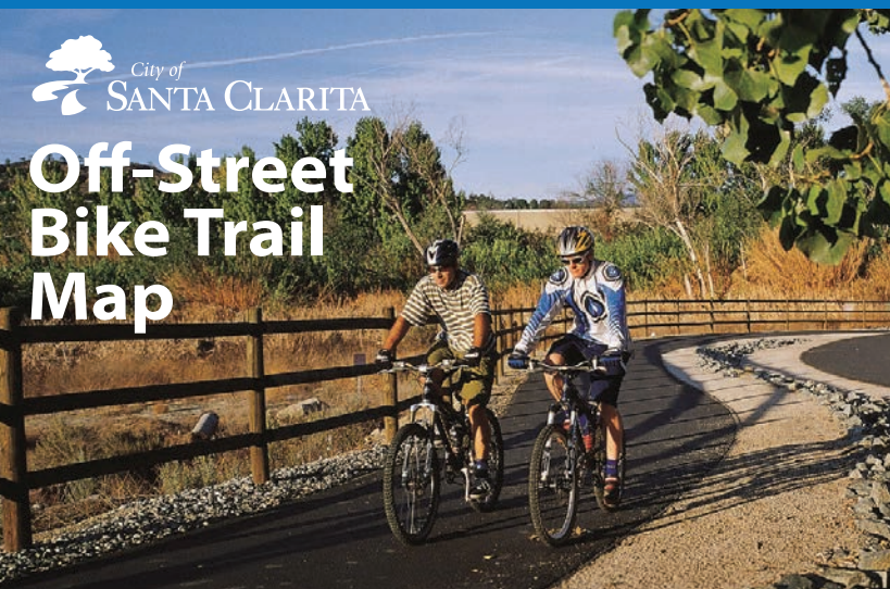
City of Santa Clarita Off-Street Bike Trail Map